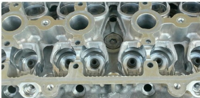
Case study 2