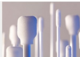
Life Sciences & Medical